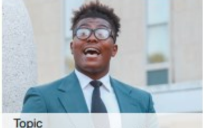
"Discovering the Optimism within Me"