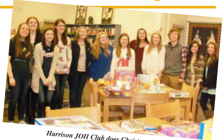
Harrison JOII Club does Christmas!