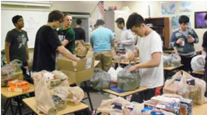
Pope Octagon Club has gathered over 2,000 cans and boxes of food plus 13 grocery cards for turkeys for the Cobb Family Resource Center's Thanks-for-Giving Food Drive. Optimists helped in the effort by donating food, boxes and grocery cards.