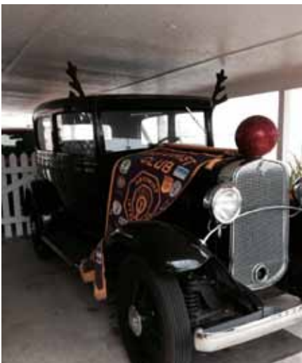
Athens Tennessee Optimist Club sports Rudolph the Red Nose Reindeer for Christmas!