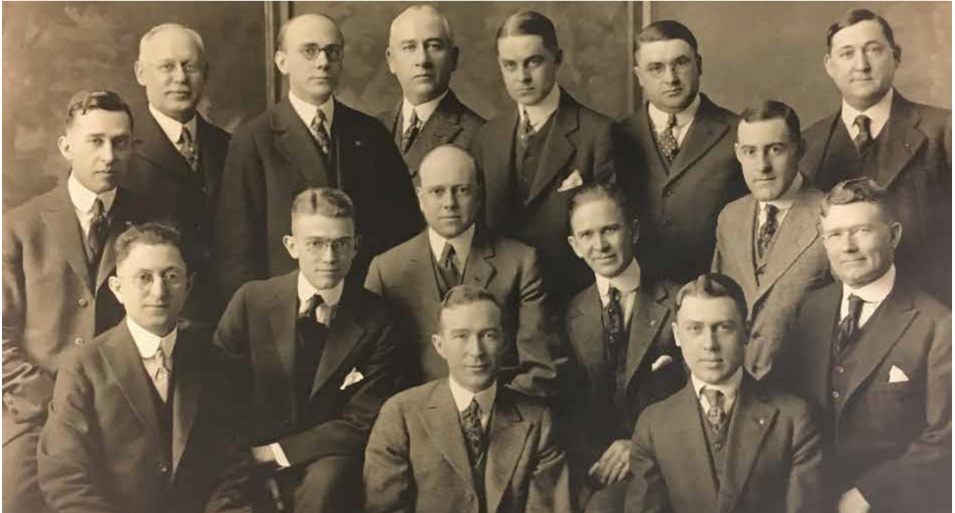
The original members of the 1916 Optimist Club of Indianapolis, Indiana

The Optimist International Organization was founded at a convention in Louisville, Kentucky, in 1919, uniting various local and regional clubs, the first of which was founded in Buffalo, New York in 1911. At the convention, the first official charter of the international organization was awarded to the club in Downtown Indianapolis, Indiana which was founded in 1916.